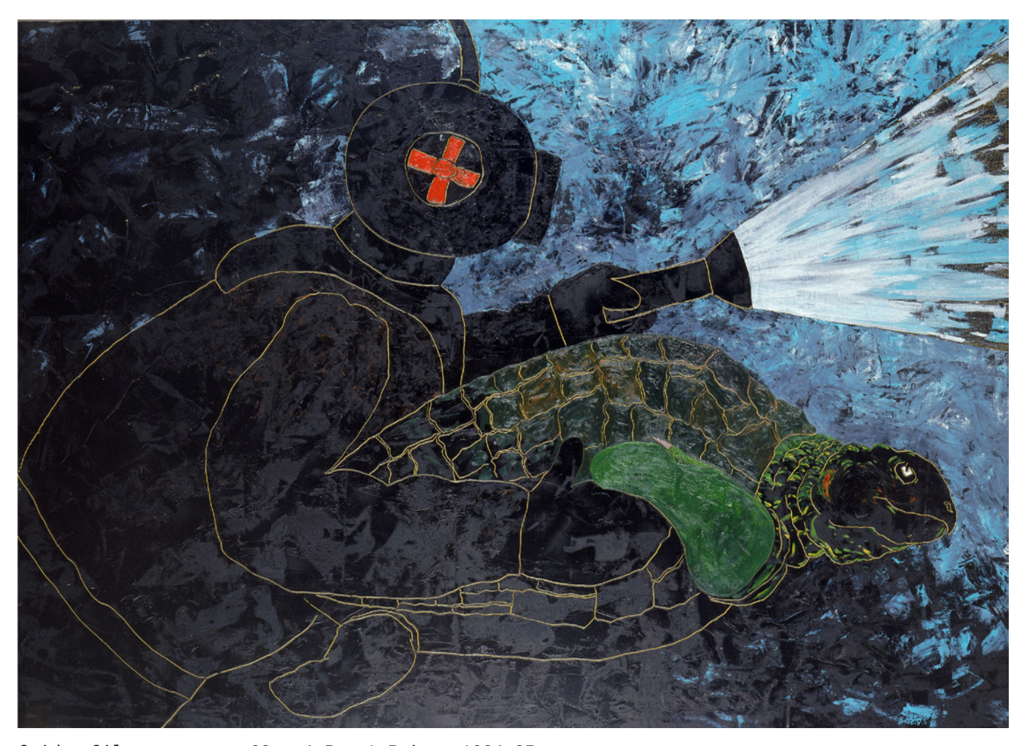
Guide, Oil on canvas, 68 x 4.5 x 1.5 in., 1984-85